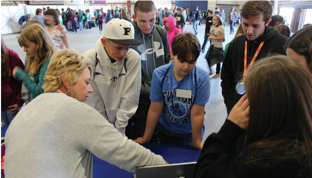
Sovah Health Martinsville showcased radiology, sonography, nursing, infection prevention and cardiovascular services to local middle and high school students at the SOVA Career Choice Expo.